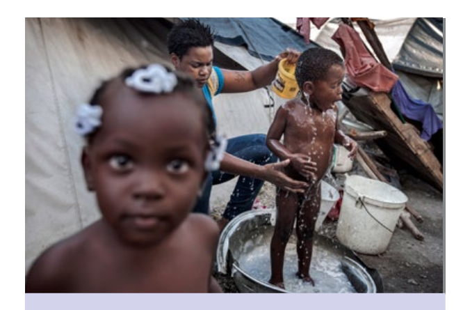
Dhaka, Bangladesh. The population of Dhaka is expected to grow to 20 million by 2020. The infrastructure is a ticking time bomb in terms of public health. Already today four million people are living in slums without access to clean water and toilets. Many are forced to use dirty well water or to buy from "water pirates" selling expensive bottled water.

Despite the vital role of hygiene in improving health and preventing antibiotic resistance, access to clean water and safe sanitation – necessities for hygiene – is still a luxury in many parts of the world. To highlight the alarming situation and spark a dialogue, Essity and Fotografiska invited world leading photojournalist Paul Hansen to organise the photo exhibition Hand to Hand. In a series of unique photographs and stories combined with powerful insights by Senior Professor Otto Cars, the exhibition highlights how lack